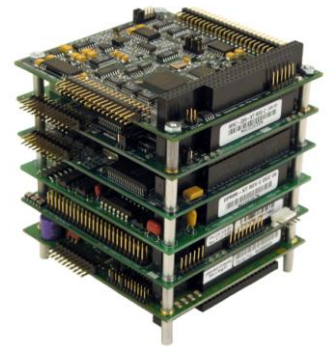
Figure 1 Older design consisting of cumbersome stacks of SBC and I/O modules

Traditional SBCs are usually built around an existing industry standard form factor, such as PC/104 or 3.5". They often include expansion buses to enable easy adaptation to a particular application by adding one or more I/O modules. The large number of I/O modules available from manufacturers around the world makes this strategy appealing to a wide range of customers and enables rapid development of embedded solutions for a large number of applications.