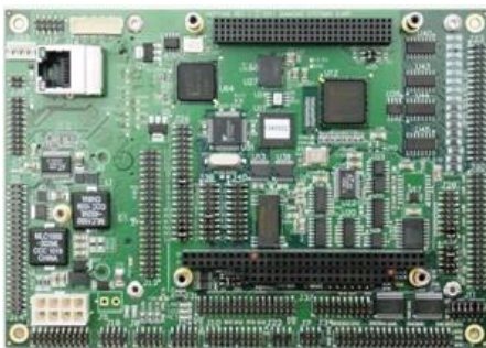
Figure 3 Neptune's I/O rich baseboard replaces the stack of modules in Figure 1

An example of a COM-based SBC is Diamond Systems' Neptune , a rugged, extended temperature, I/O rich highly-integrated EPIC-sized COM-based SBC as shown in Figure 3. By using the industry standard ETX interface, Neptune offers a wide performance range of available ETX COM CPU modules. The ETX CPU plugs into the bottom of the baseboard, which allows the implementation of an efficient heat spreader thermal solution by conducting the heat from the processor and chipset directly to the bottom surface of the enclosure.