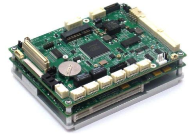
Figure 4 COM-Express sized Vega COM-based SBC

Another example of a COM-based SBC is Diamond Systems' Vega , a rugged, highly-integrated COM Express-sized SBC with interchangeable COM-Express COMs as shown in Figure 4. Eliminating the PC/104-Plus connectors and changing the overall I/O connector strategy enabled shrinking the size of the baseboard to match the size of the COM. Again the two-board solution replaces a stack of four PC/104 boards: SBC, power supply, analog I/O, Ethernet.